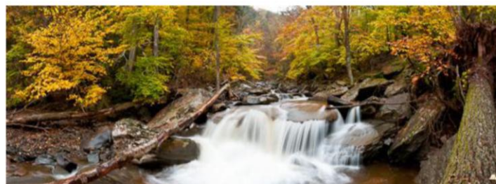
Kaaterskill Creek Falls