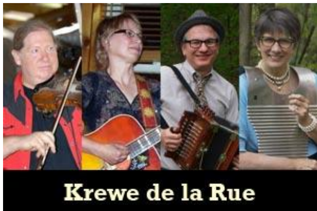
Krewe de la Rue

Advance ticket holders are will have an opportunity to enter a drawing for a complimentary three-course dinner for two, non-alcoholic drinks included, in any restaurant at the Culinary Institute in Hyde Park, NY." Expires on November 30, 2013.